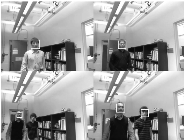
Figure 1. Sample frames from the representative test video sequence.