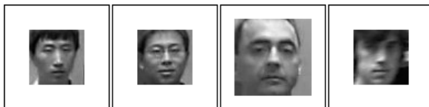
Figure 2. The contents of the face image log after the processing of the representative video.

was equipped with a 2.16 GHz Intel Core 2 Duo ® processor and 1GB of random access memory. Despite the availability of two processing cores and 64-bit instructions, the software implementation used only a single thread along with 32-bit instructions. The majority of the processing time (99%) was spent on detecting and tracking faces.